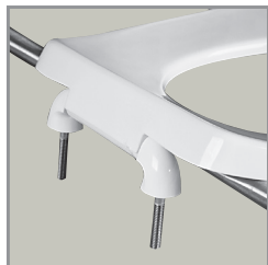
PLASTIC HINGES WITH STAINLESS STEEL POSTS AND PINTLES