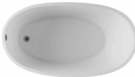
Inside view of tub.