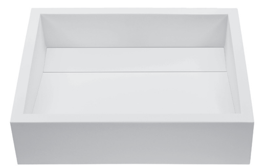
Wymara 1 features a concealed drain cover. Shown below with cover removed.